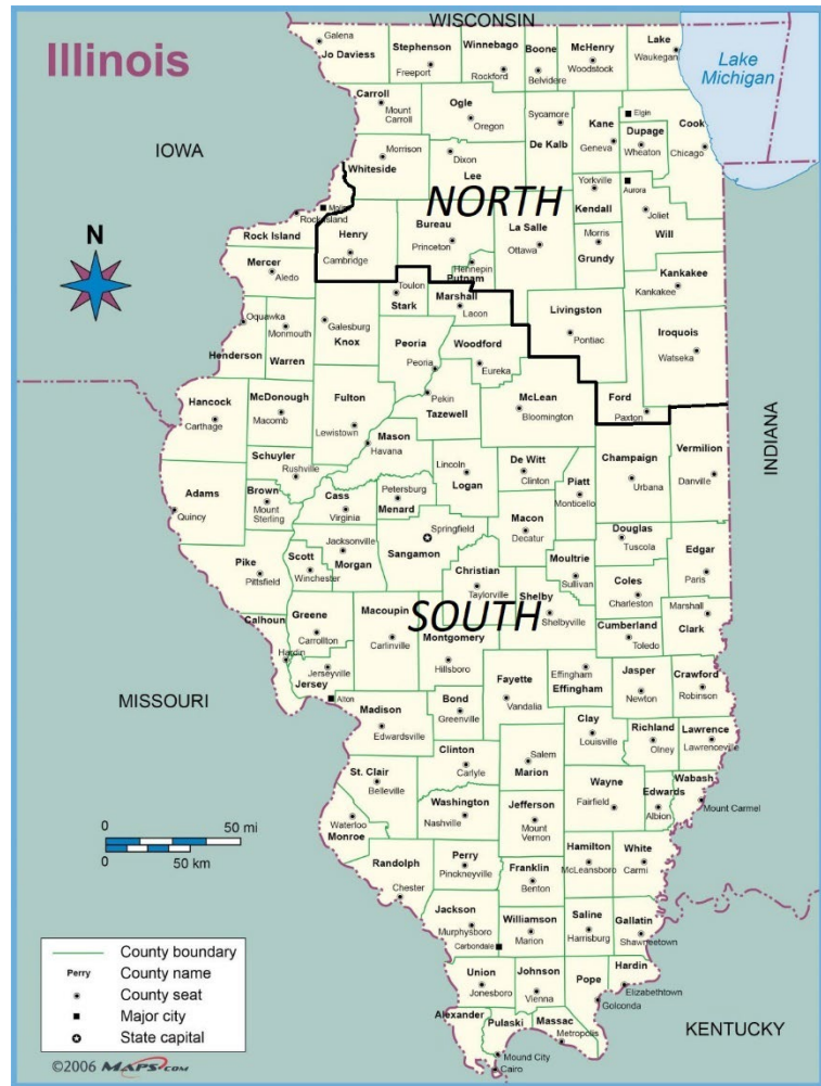
Figure 2 Illinois OSHA enforcement regions

Example: The PPI list provided to the REM has a water entity, Village of Tremont Water. A search of the Village of Tremont website shows that the Village only does billing and receives water from a water district. The REM would delete this entity from the PPI list and replace with another entity.