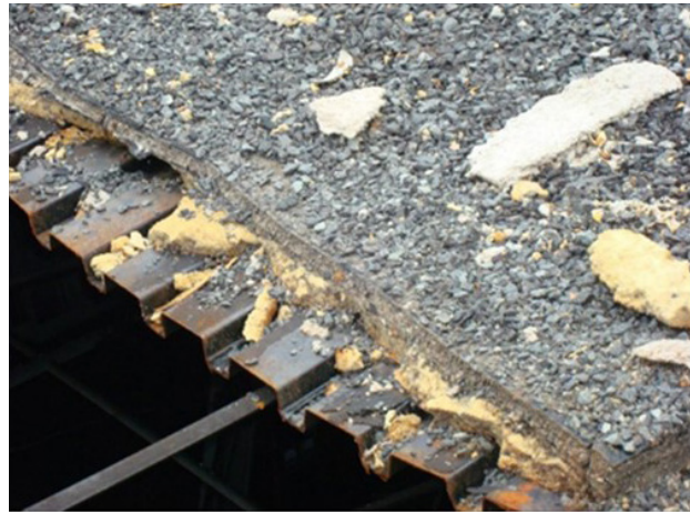
Photo 1. Construction of flat metal roof covered with asphalt foam insulation, and gravel. Chain saws were initially used to open the roof for vertical ventilation but would not cut through the metal deck. A circular saw with metal cutting blade had to be used.

The ladder company had difficulty cutting through the flat metal roof due to the composition of the roof. They unsuccessfully tried to ventilate the roof using a chainsaw and had to switch to a circular saw with a metal cutting blade. (See Photo 1 ).