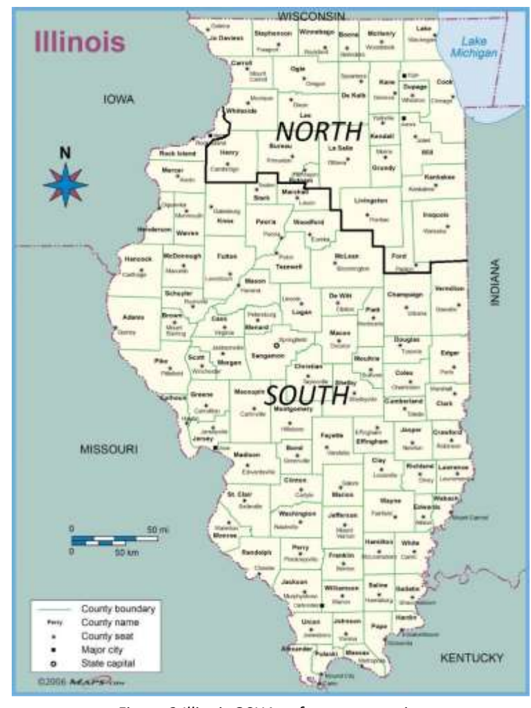
Figure 2 Illinois OSHA enforcement regions

If the REM receives an entity that just includes water or sewer (e.g. Village