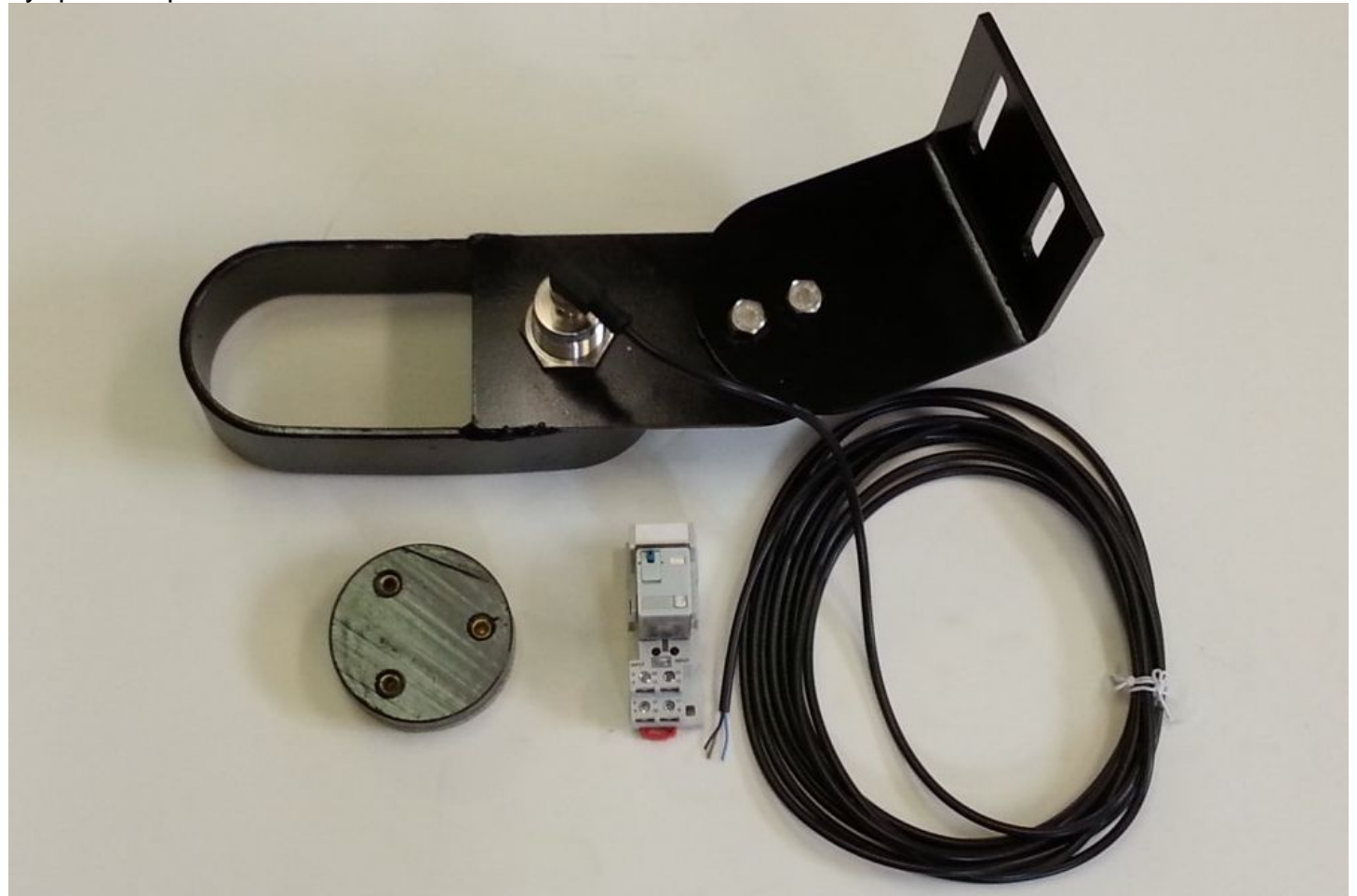
Roll Back Detection Parts Kit, $600.00 USD

Partek has developed an easily fitted system to enhance safety on Borvig lifts. This system is designed to detect a roll back within 3 inches of reverse rotation. A relay is supplied that will remove power from the bull wheel backstop solenoid and initiate an emergency stop in the lift control circuit. This enhancement is required for all Borvig lifts that do not currently have such a system in place. A wiring schematic will be provided with each kit and must be installed, wired and tested for functionality by qualified personnel.